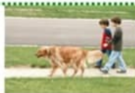
walk the dog