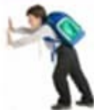
wall push ups